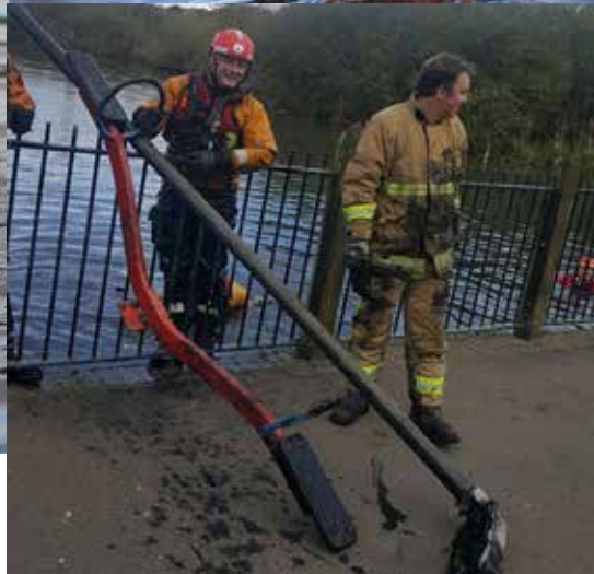
Left: Cleaning for the Queen. This page: Clearing the Moor Pool